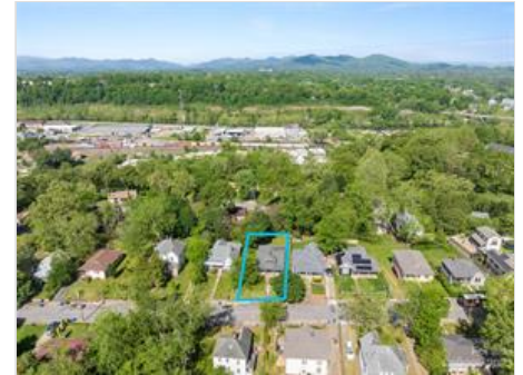
41 Ora Street: in a neighborhood of more classic homes and moments from River Arts District.