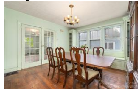
Lovely detail in the built-in cabinetry with glass doors and window seat.