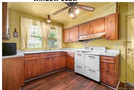
Kitchen ready for renovation.