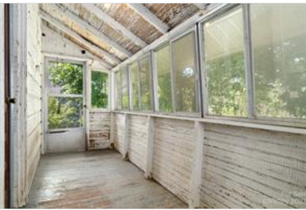
Covered back porch accessed from kitchen. Laundry hook up on porch.