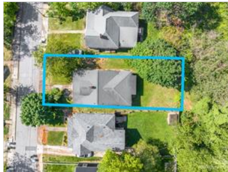
Approximate lot lines. Not meant to be a survey.