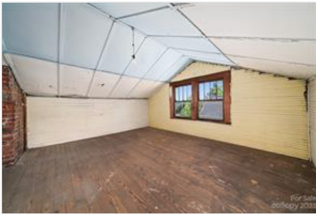
Additional walkup attic space. Was used as a bedroom at one time.