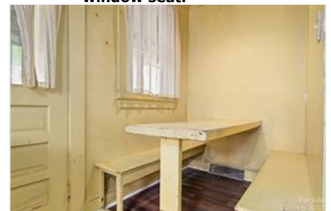
Built in table and benches for eat-in kitchen.