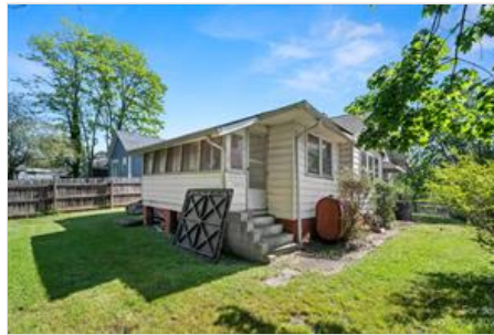
Back porch accesses backyard.