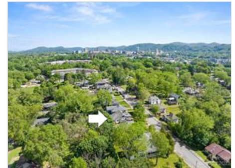
Home with view of downtown Asheville in the background.