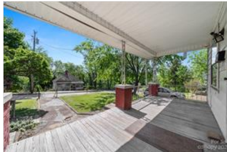
Expansive covered front porch.