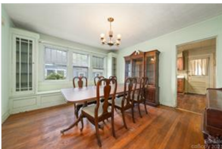
Dining room with lots of light, into kitchen.