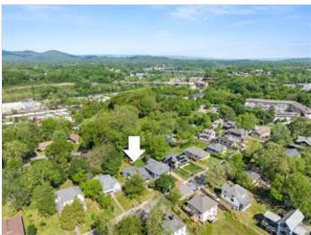
View of home location in relation to river, more River Arts District, and West Asheville.