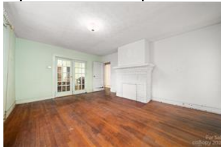
Lovely detail in the built-in cabinetry with glass doors and window seat.