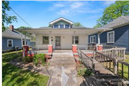
41 Ora Street, built in 1914.