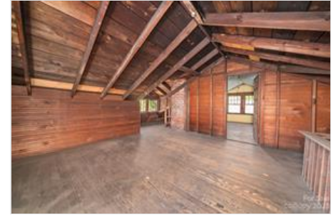
Walkup attic space.