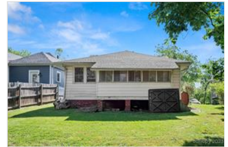
Back of 41 Ora Street.