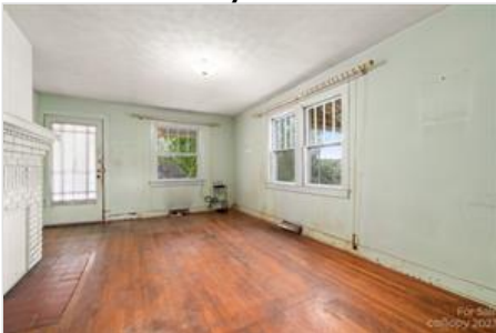
Original hardwood floors throughout.