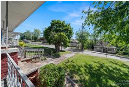
Flat front yard.