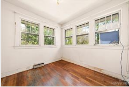
3rd bedroom accessed directly from back bedroom.