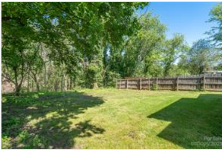
Great, level backyard!