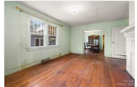
Living room from front door.