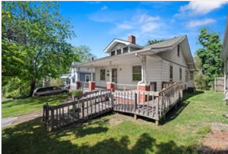
Classic Asheville bungalow ready for your renovation!

MLS#: 3935012 41 Ora St, Asheville, NC 28804 Price: $350,000